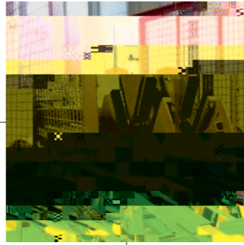
Star-shaped turning device